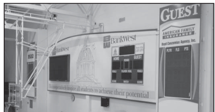
New Daktronics signs and scoreboards at Hollister Field and T.F. Riggs Gymnasium. Angel Sponsor, BankWest paid for the new equipment.